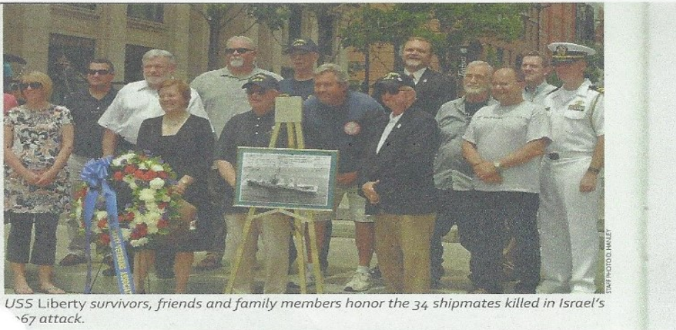
USS Liberty survivors, friends and family members honor the 34 shipmates killed in Israel's 1967 attack.