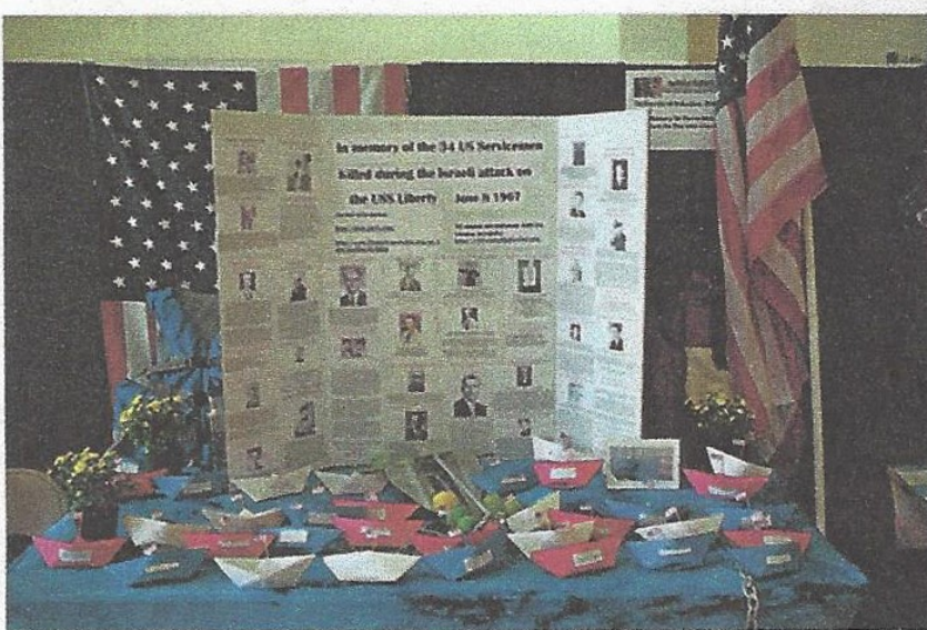
An altar on display at San Rafael, California's Day of the Dead observance honors the 34 servicemen on the USS Liberty killed by Israeli military forces.