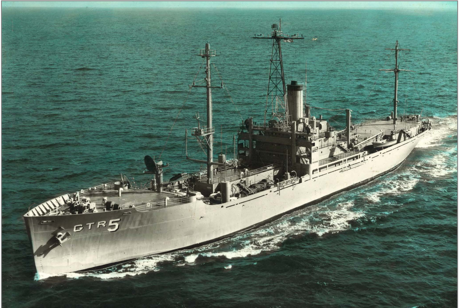
ABOVE: The USS Liberty, 1964